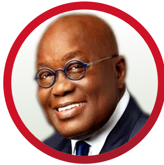
NANA ADDO DANKWA AKUFO-ADDO

Provide Stable and affordable power for Industrial Development.