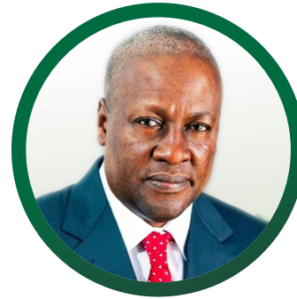
JOHN DRAMANI MAHAMA

Bridge the Development Gap between the North and the South